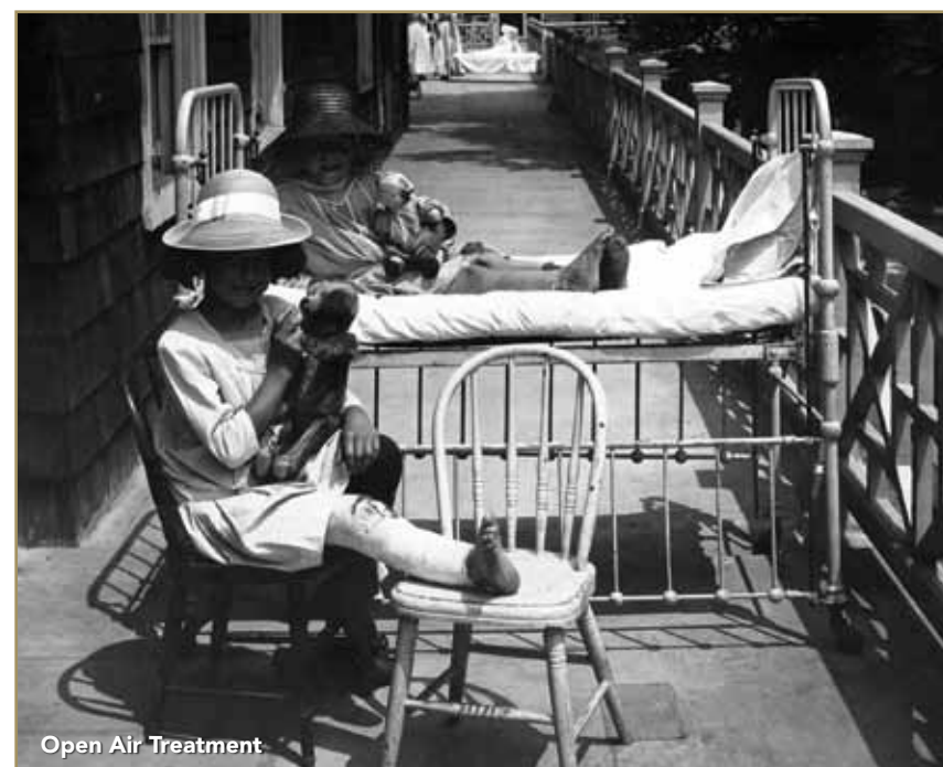
Open Air Treatment