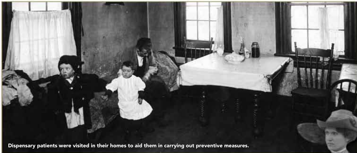
Dispensary patients were visited in their homes to aid them in carrying out preventive measures.