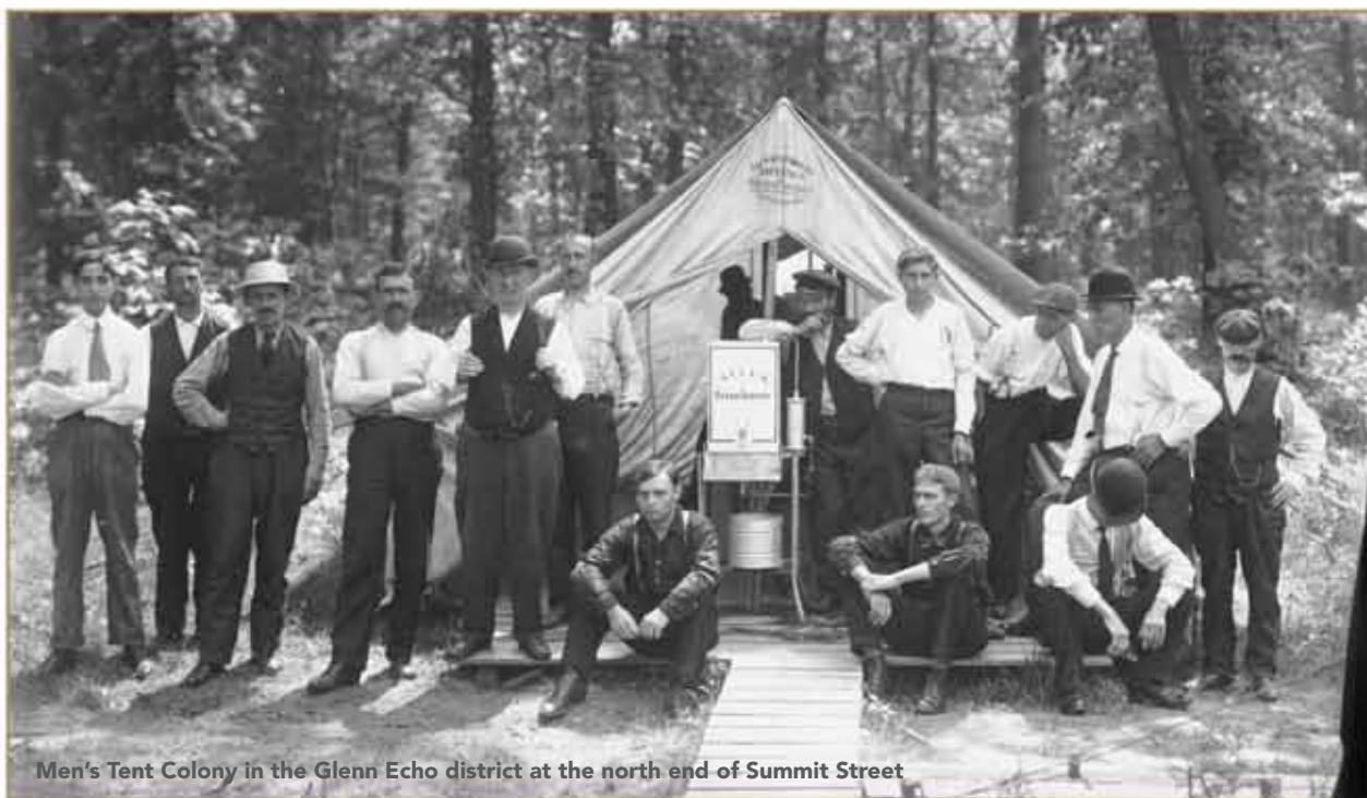
Men's Tent Colony in the Glenn Echo district at the north end of Summit Street