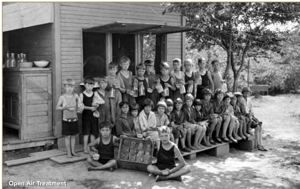
Open Air Treatment