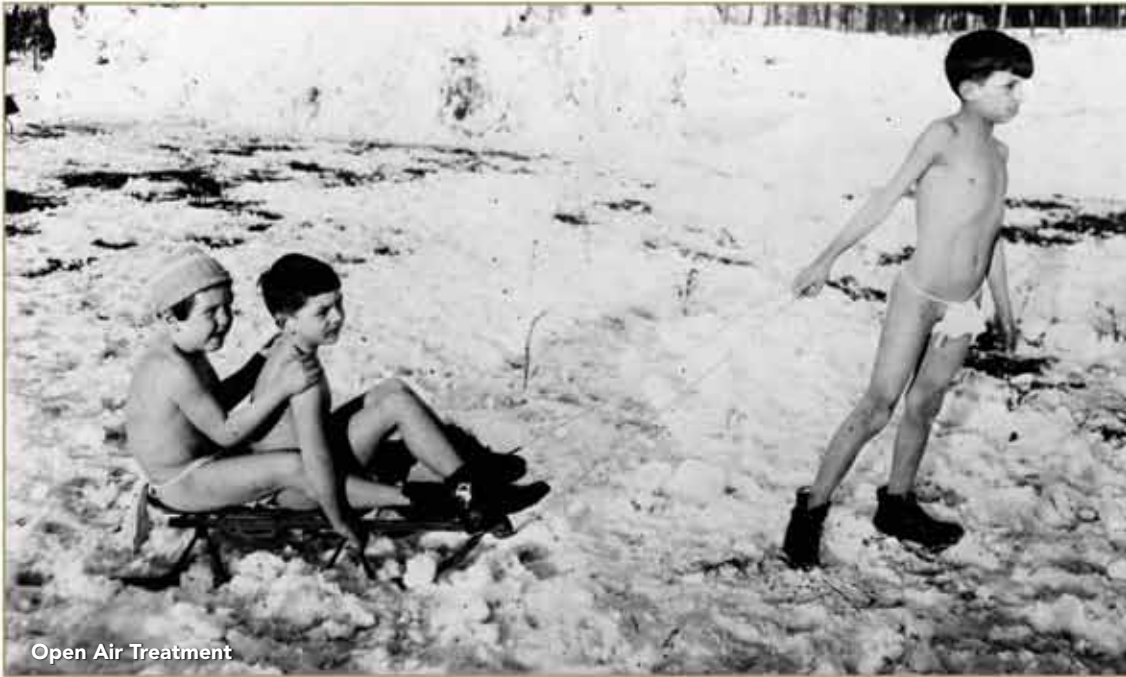
Open Air Treatment