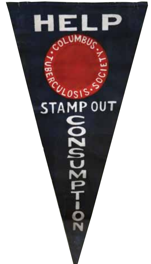
The 1906 Pennant of the Columbus Tuberculosis Society. "Consumption" was the early word used for tuberculosis.