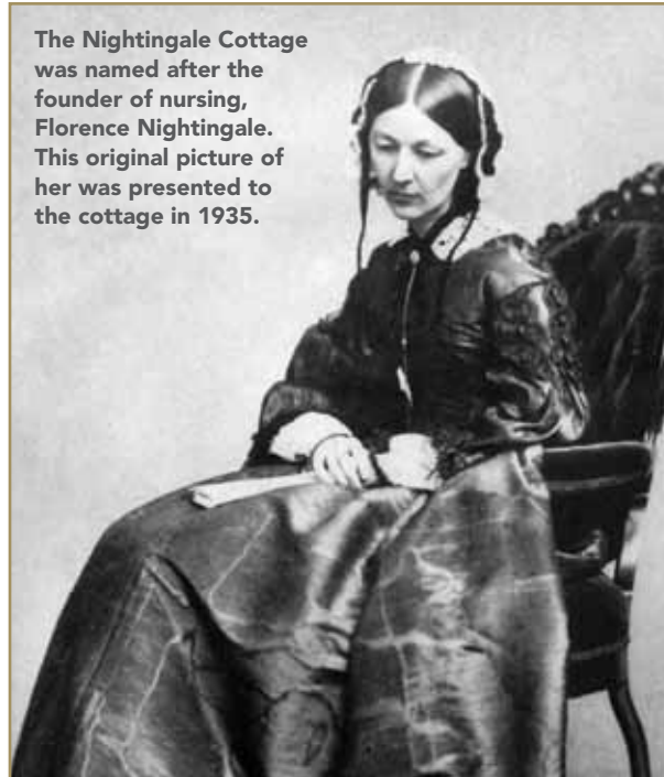
The Nightingale Cottage was named after the founder of nursing, Florence Nightingale. This original picture of her was presented to the cottage in 1935.