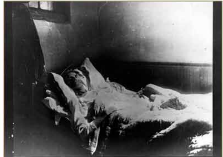
The Dying Consumptive Can-Avoid Infecting the Home.