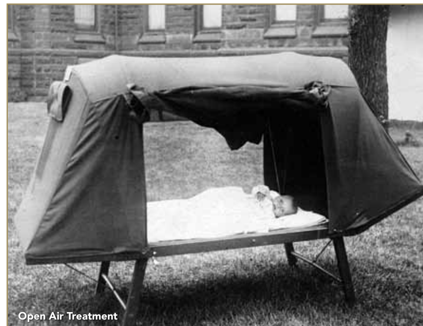
Open Air Treatment