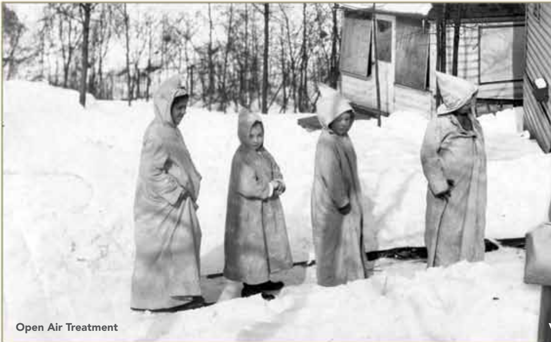
Open Air Treatment