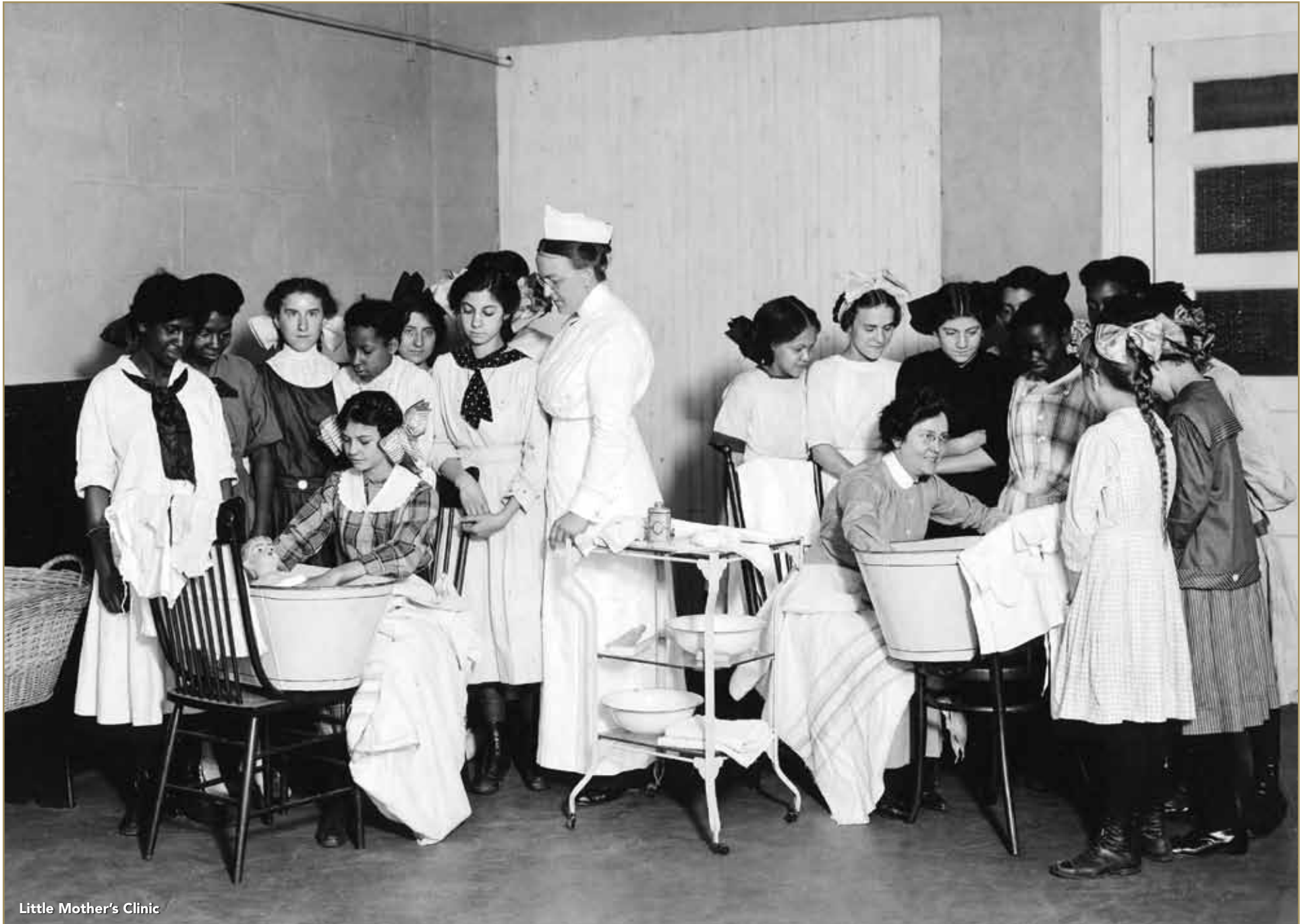
Little Mother's Clinic